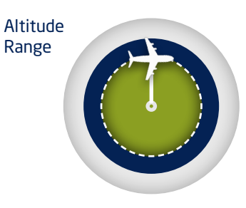
Site level to 40,000 ft