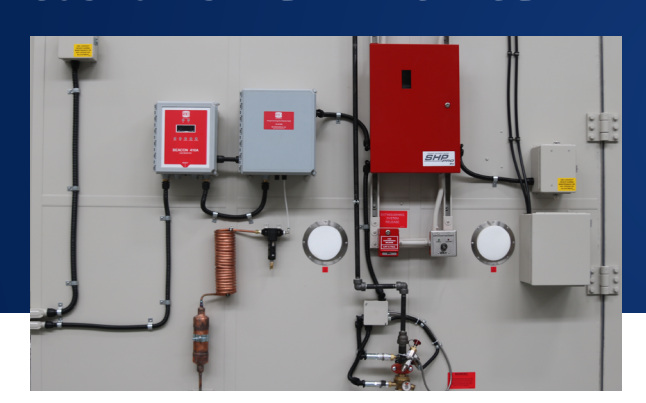
Gas Measuring system for H2, O2, & CO