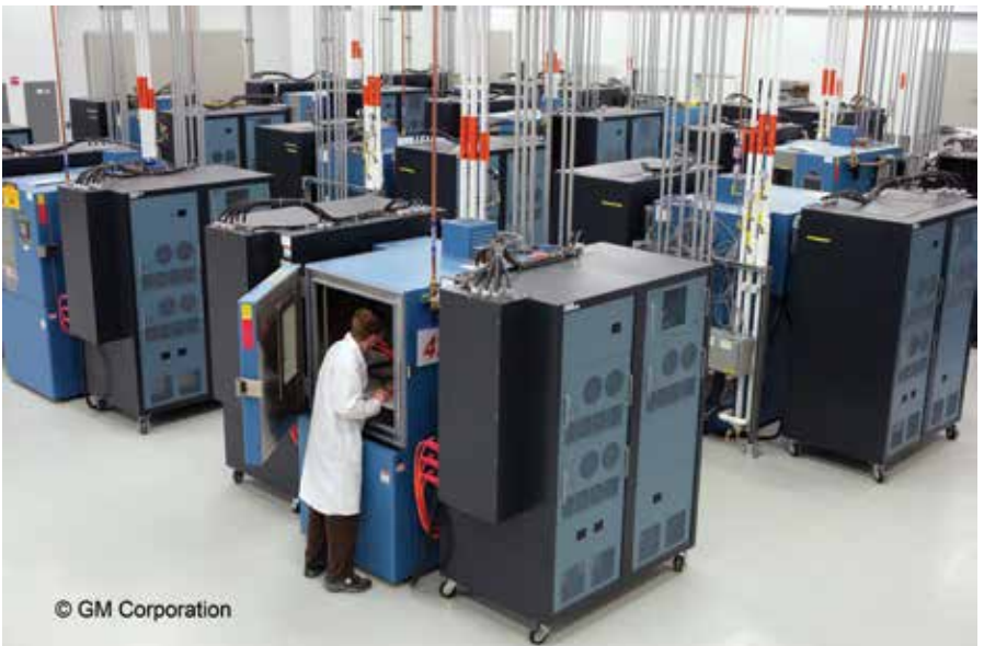
CSZ reach-in and walk-in chambers featured at GM Battery Test Laboratory.

Each test chamber is built according to specific test requirements and may be interfaced with battery cyclers, control & monitoring data acquisitions systems and other test equipment for a complete integrated test solution.