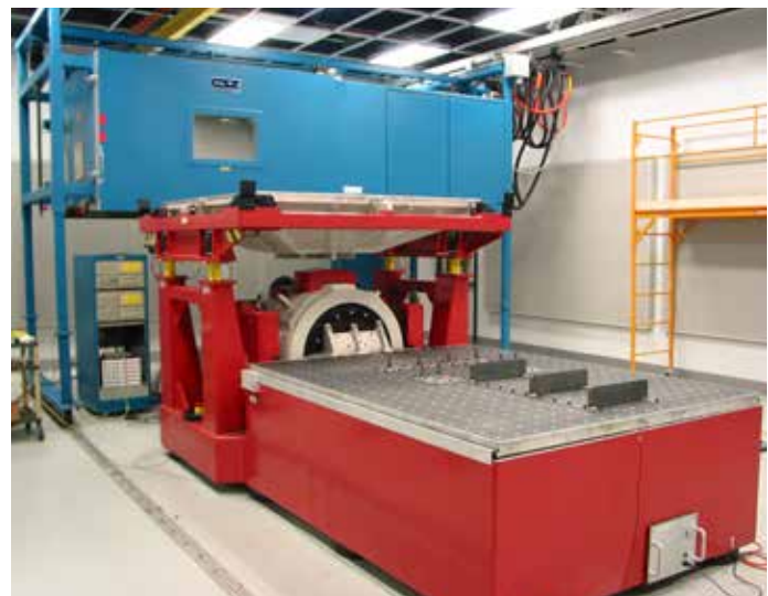
AGREE Temperature, Humidity Chamber interfaced with Vibration Shaker Table

We offer extensive experience in chambers designed for battery testing from small battery cells to large battery packs.