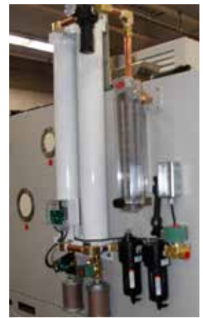
Fresh Air System