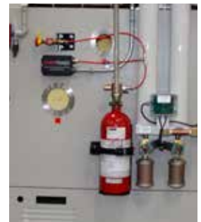
Fire Suppression System