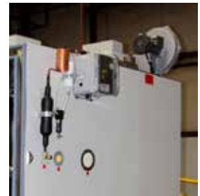
Gas Monitor System